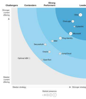
Forrester Wave™, IaaS For Enterprise, Q3 2021 THE FORRESTER WAVE™ Identity As A Service (IaaS) For Enterprise Q3 2021