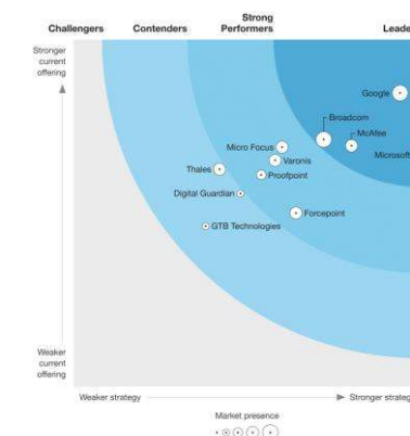
FORRESTER THE FORRESTER WAVE™ Unstructured Data Security Platforms Q2 2021