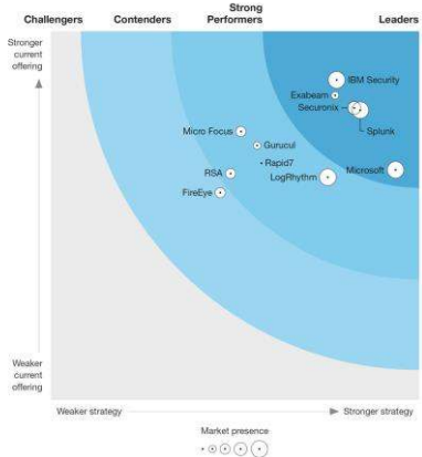
THE FORRESTER WAVE™ Security Analytics Platforms Q4 2020