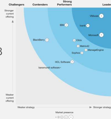
THE FORRESTER WAVE™ Unified Endpoint Management Q4 2021