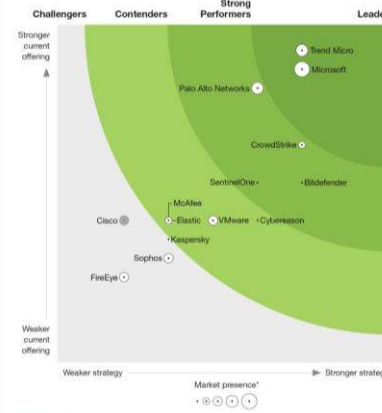
Forrester New Wave™, Extended Detection And Response (XDR) Providers, Q4 2021 THE FORRESTER NEW WAVE™ Extended Detection And Response (XDR) Providers Q4 2021